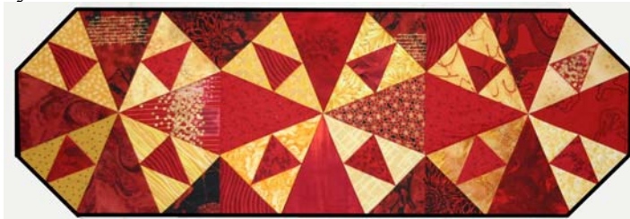
Harbor Lights Table Runner © 2007, Jan P. Krentz – 15" x 45"

If you are interested in trying the technique and want a quick achievable project that you can finish in one day, create a Harbor Lights Table runner from 3 or 4 blocks! The table runners provide a great small project to practice your machine or hand quilting, and make ideal gifts for family and friends.