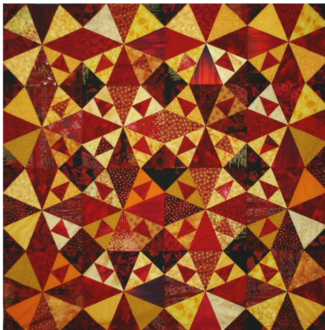
Sunset Point Harbor Lights variation – 62" x 62" by Jan Krentz, © 2007; quilted by Carolyn Reynolds

This design is based upon the historic Signal Lights block. It's updated with large-scale blocks, quickly cut with the Fast2Cut rulers, and a "faux piecing" technique to create the smaller triangles. Simplified blocks at the outer edges create a border effect. This throw-sized quilt features 16 blocks, and could easily be enlarged for a quick stash-busting bed quilt!